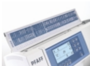
All stitches are clearly displayed inside the lid.